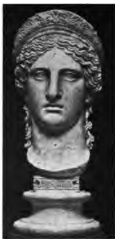
Fig. 9. Head of Hera.

Greek artists conceived of Hera as a woman in the full bloom of her age, of majestic form